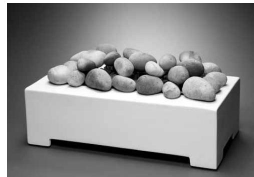
all dimensions in inches, \pm 0.20