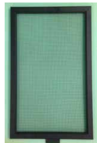
(Short Screen) 10-1/4" W x 16-3/8" H