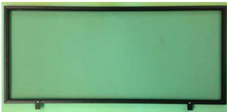
(Long Screen) 37-3/16" W x 16-3/8" H

For BIDORE / TRISORE the number of "Short Screens" will vary. Please follow the installation process shown at the end of this manual.